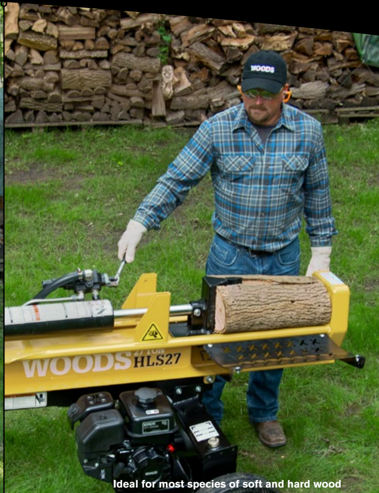
Ideal for most species of soft and hard wood

For a limited time, get the Woods 27-Ton Log Splitter packed with features including a Kohler® engine and high-strength U.S. steel for tough, reliable performance day after day and year after year.